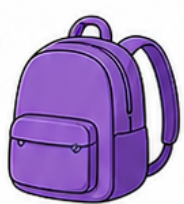
书包 (shūbāo) backpack