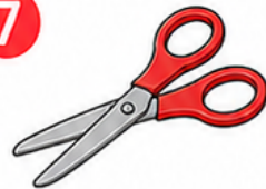
剪刀 (jiǎndāo) scissors