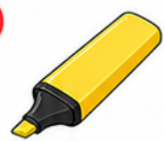
荧光笔 (yíngguāngbǐ) highlighter