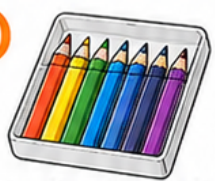
彩色铅笔 (cǎisè qiānbǐ) colored pencils