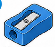
卷笔刀 (juǎnbǐdāo) pencil sharpener