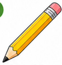
铅笔 (qiānbǐ) pencil