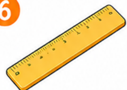
尺子 (chǐzi) ruler