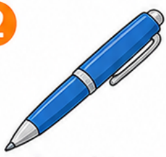
钢笔 (gāngbǐ) pen