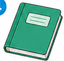
笔记本 (bǐjìběn) notebook